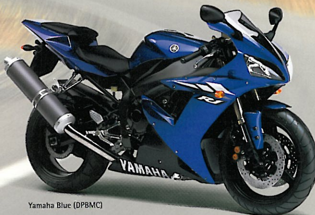
Yamaha Blue (DPBMC)