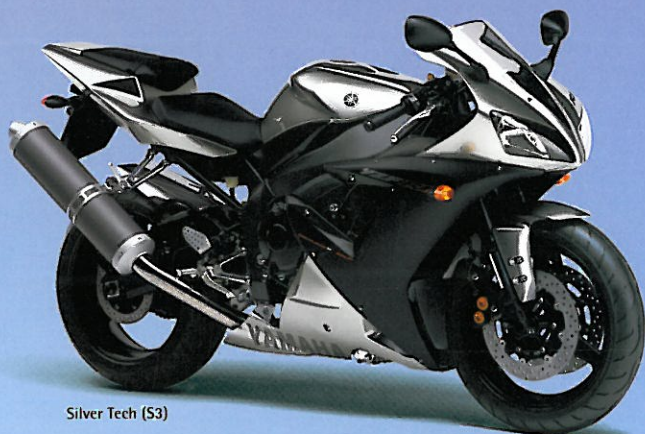
Silver Tech (S3)