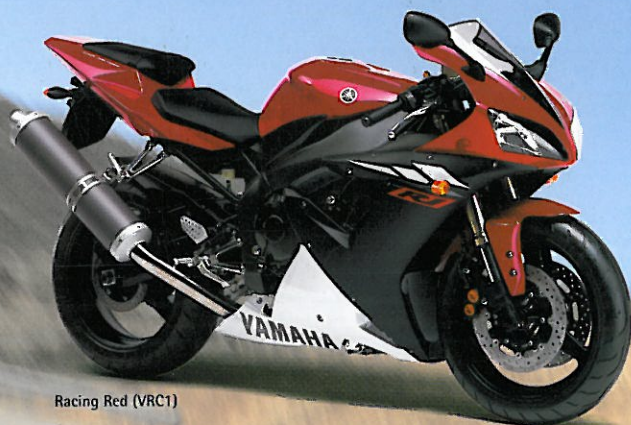
Racing Red (VRC1)