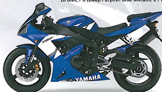
DPBMC / R (Deep Purplish Blue Metallic C / R)

If you prefer a more race-inspired look you have the option of a deep purplish blue colour scheme that incorporates the famous Yamaha speedbar-type graphics.